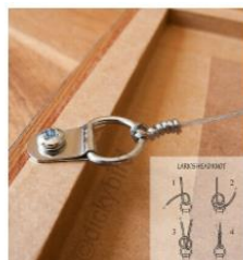
All work MUST be ready to hang with a hanging wire.