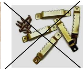
NO SAWTOOTH HANGERS

WAIVER OF LIABILITY: THE UNDERSIGNED HERBY AGREES TO RELEASE AND FOREVER DISCHARGE THE GOLD COAST WATERCOLOR SOCIETY, INC, ITS DIRECTORS, MEMBERS AND AGENTS, AND THE MANAGEMENT AND STAFF OF Sugar Sand Park FROM ANY RESPONSIBILITY FOR DAMAGE OR LOSS OF ANY KIND ON ALL WORKS SUBMITTED FOR SALE OR EXHIBITION. THE GOLD COAST WATERCOLOR SOCIETY RESERVES THE RIGHT TO PHOTOGRAPH WORKS FOR PUBLICITY AND PROMOTION. INSURANCE OF ARTWORK IS THE RESPONSIBILITY OF THE SUBMITTING ARTIST.